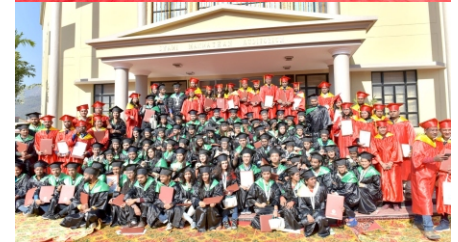
Sixth Convocation held on December 1, 2018