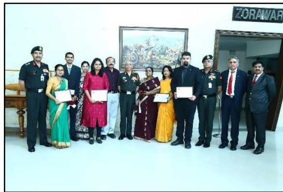
2019-20 : Winners and their Parents With COAS, VCOAS, DGPP and Director CLAWS