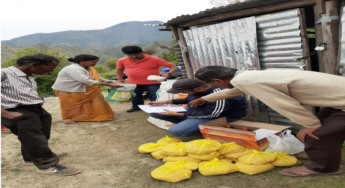
Image: Distribution of food items in village Pokhari by UBA cell