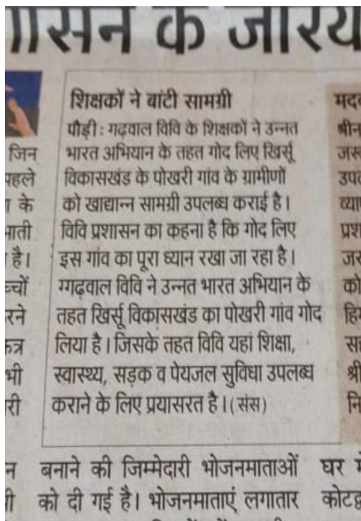
Image: Media Coverage of UBA activity