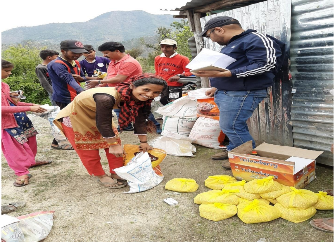
Image: Distribution of food items in village Pokhari by UBA cell