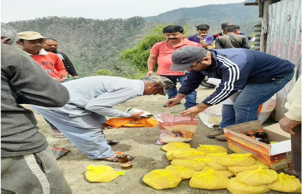
Image: Distribution of food items in village Pokhari by UBA cell