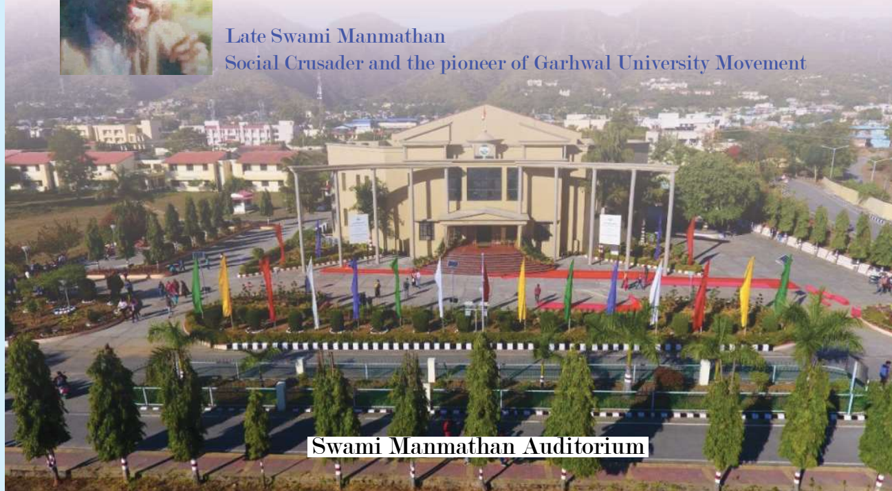
Swami Manmathan Auditorium